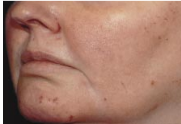
Fig 5. Crusting 4 days after long-pulsed alexandrite laser irradiation of terminal facial hairs.

The Nd:YAG laser at a 1064 nm wavelength is ideal for treating patients with darker skin tones. 1,24-27 The relatively long infrared wavelength has less affinity for melanin than the red light ruby and alexandrite systems. Most of the side effects that occurred with the Nd:YAG hair removal laser process were mild (eg, swelling, folliculitis, discomfort) and probably related to pretreatment wax epilation rather than to the laser treatment itself. Treatment pain occurred when maximal laser repetition rates were