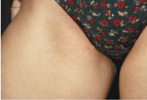
Fig 1. Erythema and mild perifollicular edema immediately after laser-assisted hair removal occurred in virtually all patients undergoing the procedure.