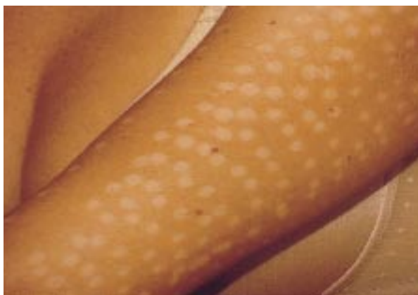
Fig 4. Hypopigmentation noted 1 month after long-pulsed ruby laser treatment of hypertrichosis.

The long-pulse ruby and alexandrite laser systems produced equivalent and an increased number of side effects that were influenced by skin type (Table IV), seasonal variations (Fig 3), and patient history of recent sun exposure. Complication rates also varied according to the anatomic location treated (Table V). The extremities were most commonly affected, and sun-protected areas such as the axillary and inguinal regions resulted in the fewest treatment side effects. Blistering and fine epidermal crusting as well as hypopigmentation and purpura were experienced more commonly in darker skin tones (phototypes III and higher) or in tanned skin (Figs 4 and 5). Average duration of postinflammatory hyperpigmentation was 2 months, whereas hypopigmentation typically persisted for 3.5 months. Long-term adverse sequelae and scarring were not observed with any of the laser systems under study.