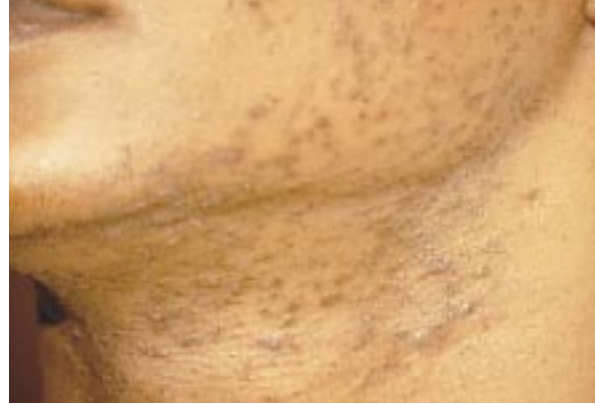
Fig 2. Exacerbation of folliculitis after SoftLight laser process (waxing, topical carbon-based solution application, low fluence Q-switched Nd:YAG laser irradiation).

hair growth on the face, torso, and extremities were treated. Skin phototypes I-V were represented. No specific preoperative skin care regimen nor topical anesthesia was used. Hair removal treatments by means of either a QS Nd:YAG, long-pulsed ruby, or long-pulsed alexandrite laser were performed. The choice of laser system used was based on each laser's availability and working condition and randomly assigned rather than on distinct patient selection criteria (Table I). In general, patients with lighter skin tones were treated with higher fluences than those with darker skin tones (Table II). All laser treatments were delivered on a monthly basis.